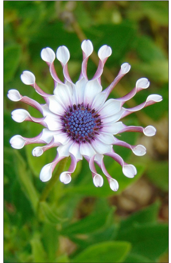
Discover the unique plants found in Monteverde