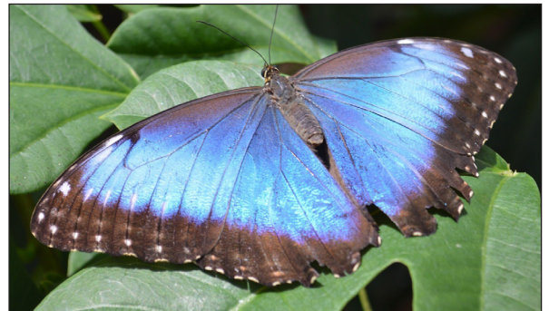
See beautiful Blue Morpho butterflies

While I may be "geeking out" over the incredible insects we'll encounter, rest assured plant enthusiasts, there will be an abundance of flora to admire as well. From stunning tropical